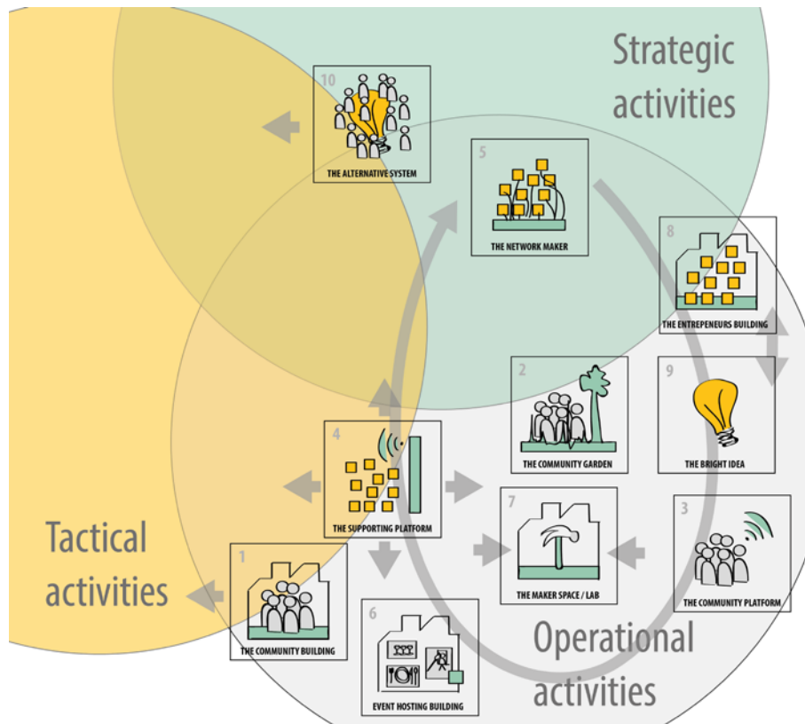
Figure 2 Mapping of the ten types of city makers according to their focus on activities

Last, the ten types of emerging city makers are mapped according to their focus on types of transition activities. The mapping is again made according to the activities that the initiatives purposely act out, not the ones they unintentionally act out. For example, an initiative could perform operational activities of starting a community garden. This could provoke the local government to invest in more green areas in the city. That way the garden could be seen as a strategic activity and a tactical activity, but this was not necessarily the aim of the initiative.